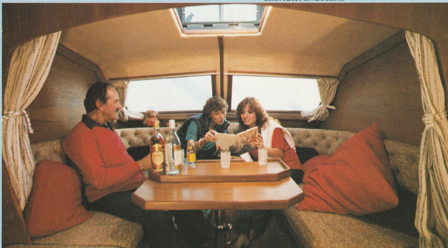
Settee Area Forward Saloon

Standard fitting is the reliable 22hp 3cyl Yanmar diesel with gearbox and 2:1 reduction driving, via a specially designed outdrive leg, a large 3 bladed prop. This superior drive system lifts clear of the water to reduce drag whilst sailing, provides additional vectored thrust whilst manouvering and greatly simplifies maintenance and servicing. It also means an end to stern tube leaks and makes clearing a fouled prop simple. Cruising speed is between 6-8 knots whilst fuel consumption is between \frac{1}{3} - \frac{1}{2} gallon per hour. Other engine options are available up to and including a twin engine motor sailing configuration. More and more yachtsmen throughout the world are turning to the Prout Snowgoose to provide the liveable answer to cruising under sail; and though it's easy to list the advantages, shorter passage times, upright fatigue free sailing, comfort even in the harshest of conditions to name but a few, words alone cannot do justice to the overwhelming superiority of the Snowgoose 37. Only seeing is believing, so Prouts extend an open invitation to all yachtsmen, simply make an appointment direct or with your local agent for a no quibble test sail. May it be your first step towards the better side of sailing.