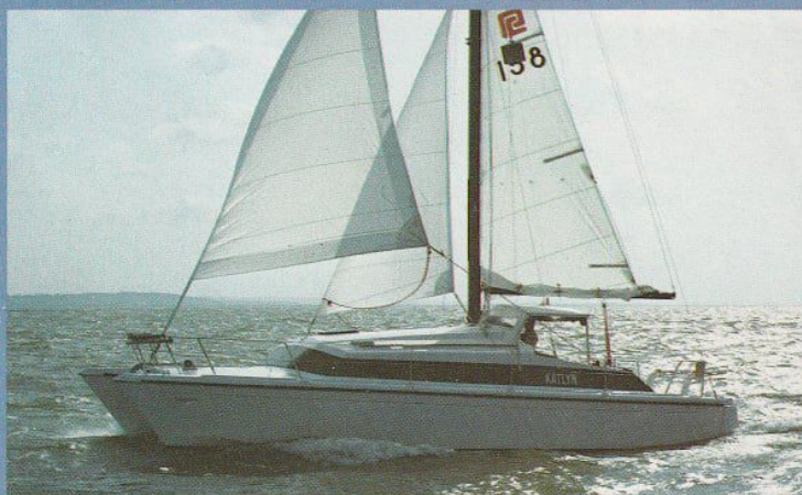
Motor Sailer Option

Although we do not promote our craft as racing boats we list below a few recent successes of our standard production catamarans.