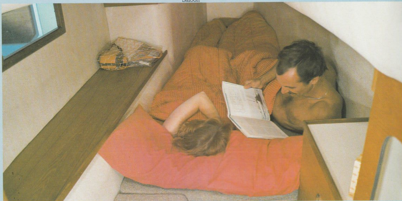
Aft Port Double Cabin